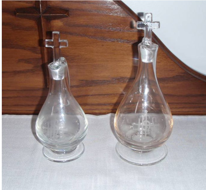
Cruets – Water (short, on left), Wine (tall, on right)