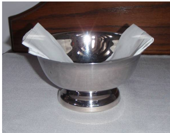
Lavabo, with Towel